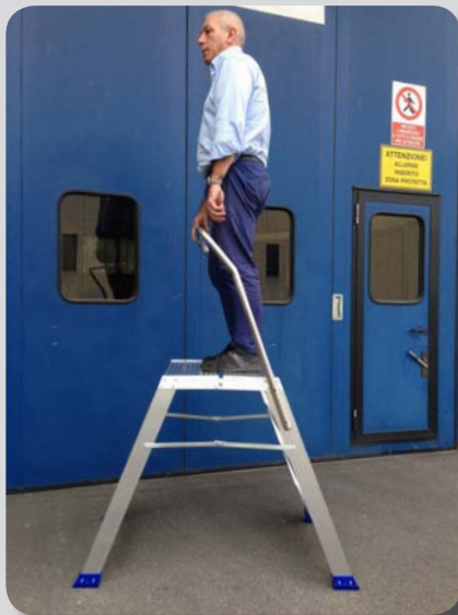
Punto Space S with optional guardrail

STEPS DISTANCE: DECREASED BASE WIDTH: INCREASED