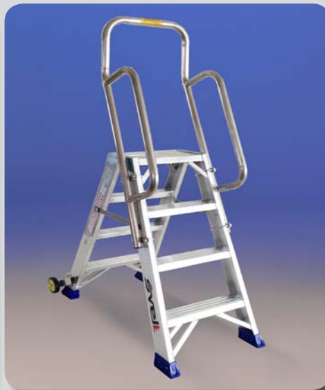
Punto Space S can be equipped with guardrail combined with 2 handrails, 2 or 4 wheels, 2 or 4 levellers for stairways or slopes.