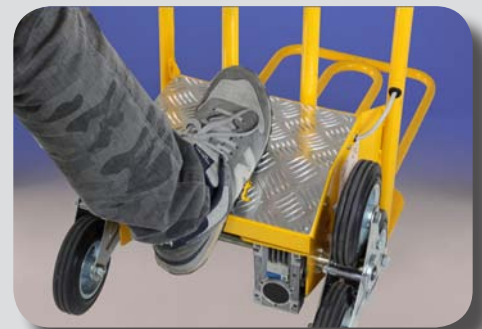
KNURLED ALUMINIUM PLATFORM: It allows leaning and pushing of the foot to tilt the load.

Accidents at work are numerous and, in addition to victims, they have considerable repercussions for the companies involved. One of the most affected areas is transport. It is very easy to get hurt while transporting a washing machine, a fridge or, worse, a locker or a safe on a stair. These are heavy loads, bulky and especially dangerous for themselves and their employees, as well as for anyone in the neighbourhood. Occupational diseases are also increasing. Back pain or muscle tearing could become chronic with consequences for the worker and the company. Electric Stairclimber is the means to work safely with a low investment.