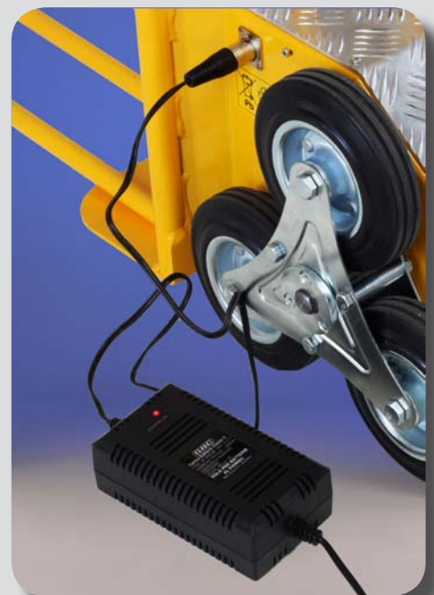
AUTOMATIC BATTERY CHARGER: Just plug in the charger and in 4 hours the handtruck is ready for use with the maximum charge.

On flat ground, it is possible to tilt the Stairclimber with the controls, as it is more convenient for the operator. The controls also facilitate the override for cargo transport.